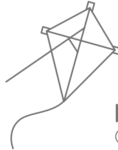
たこ Kite (カイト)